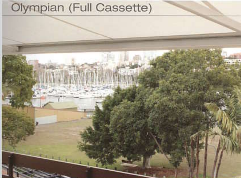
Olympian (Full Cassette)

Patented aluminium brackets and components with precision engineering.