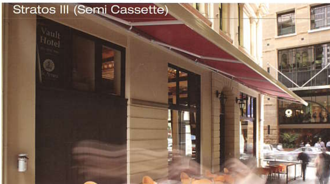
Stratos III (Semi Cassette)

Stratos III is a slimline design whose elegant, unobtrusive appearance suits both residential and retail applications, including recessed installations.