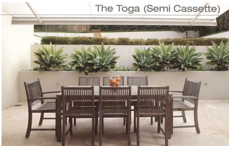
The Toga (Semi Cassette)

The Toga also can be adapted to incorporate our special Oversquare design whereby the awning can project to a distance that is greater than its width. This offers a smart way to squeeze a deep projection into a narrow space such as courtyards in inner city housing.