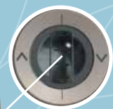
Telis Modulis scrolling Thumbwheel