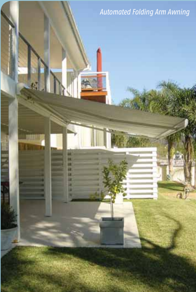
Automated Folding Arm Awning