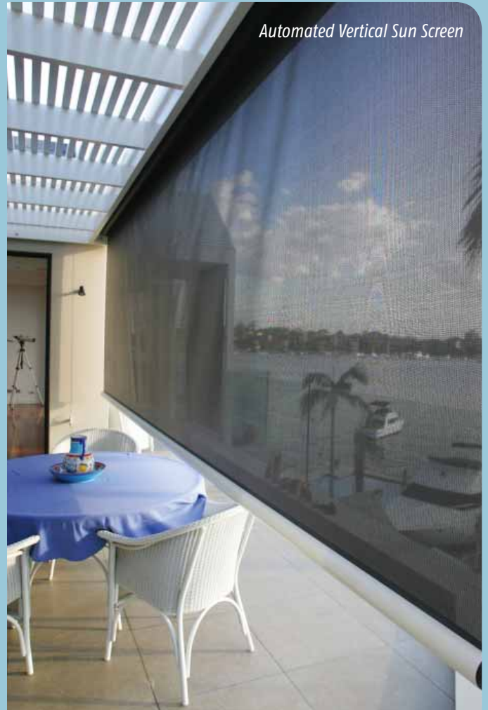
Automated Vertical Sun Screen