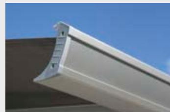
Front profile with decoration strip