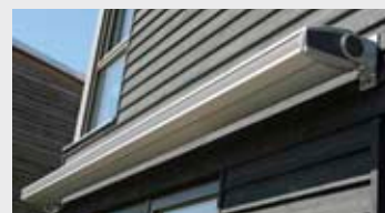
Closed awning with end caps and front strip decoration