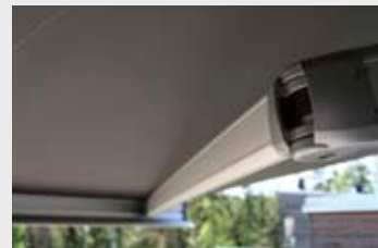
Heavy duty folding arms with Dyneema® connections