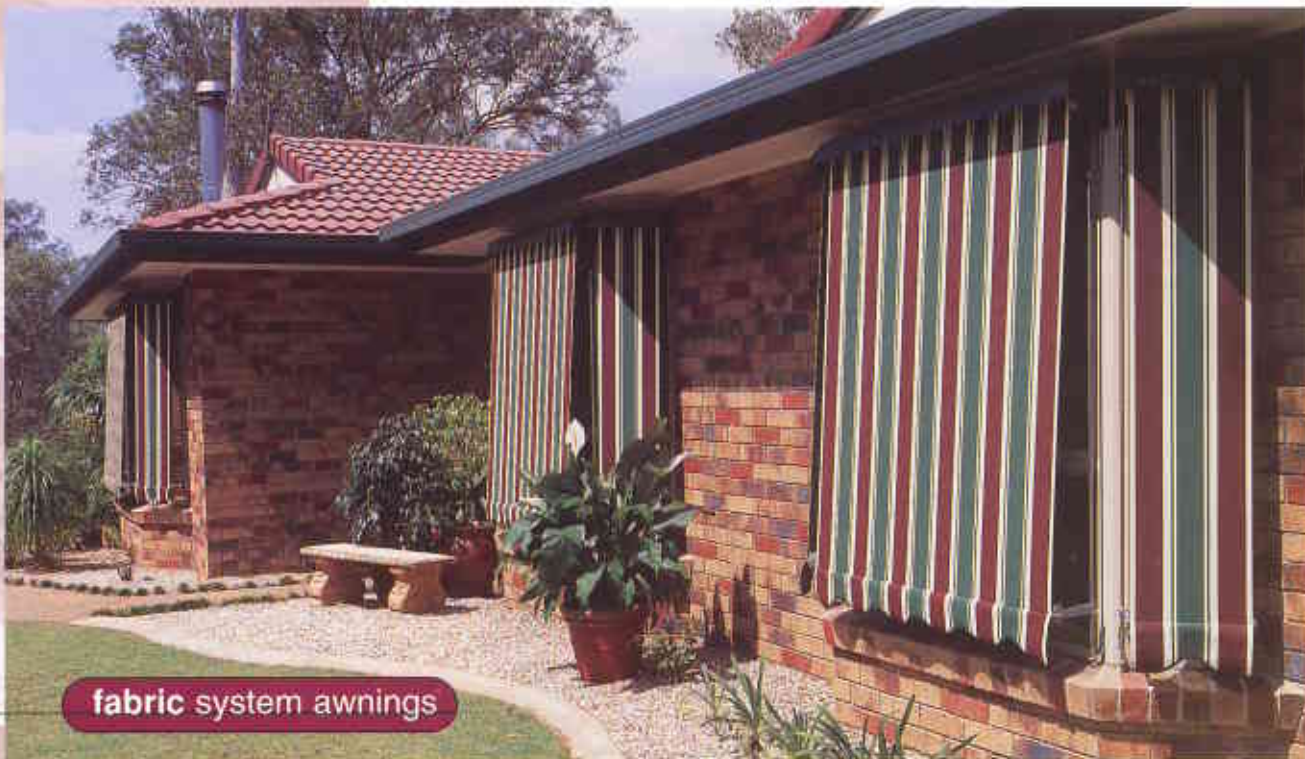
fabric system awnings