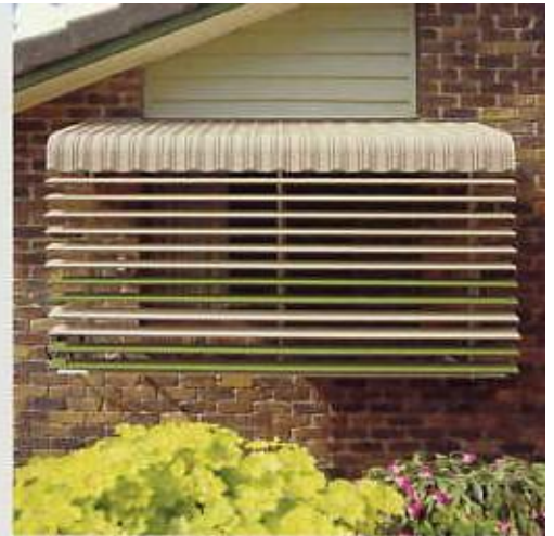
An opened Adjustable Awning offers a view while allowing a cooling breeze.

In addition to weather control, the awning's all-over window cover acts as a safeguard against accidental window damage (from falling branches, children playing ball games etc.) This awning is available in a Fixed and an Adjustable style.