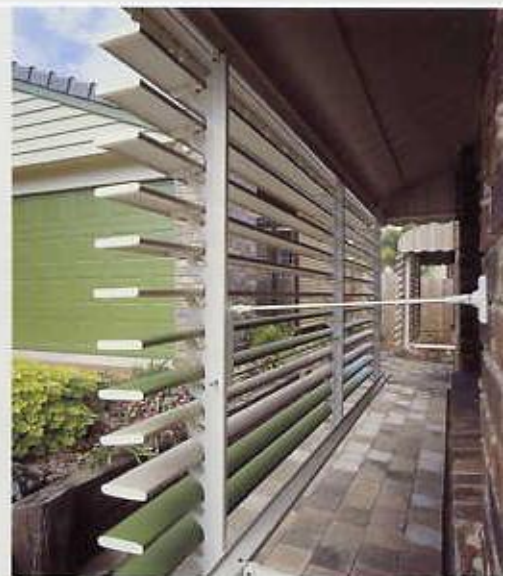
Maximum Heat Deflection.

In hot/wet weather the panels can be angled to offer the best compromise between protection and view.