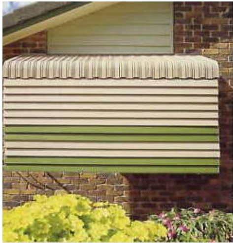
Panels can be closed for optimum privacy and sun protection.

The Louvre awning provides excellent protection from the elements, whether sun, wind or rain; the sturdy aluminium construction promises years of trouble free use. Should any of the panels be damaged, the design also provides for easy panel replacement without removing the awning.