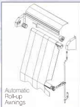
Automatic Roll-up Awnings

Uniline Tru-style awnings provide outstanding durability and anti-corrosion performance and with quality BHP steel tubing and components it ensures a long life for your awning.