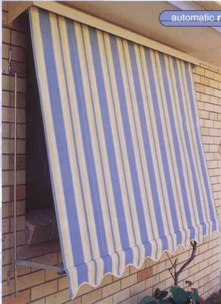
automatic roll-up awnings

Protect your home and cut down your cooling expenses with Australian made Uniline Tru-Style fabric awnings.